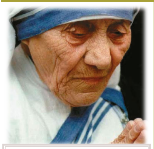
September 5—Feast day of St. Teresa of Calcutta Humility personified!

and you will find favor with God" Sirach 3