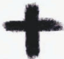
First in Line