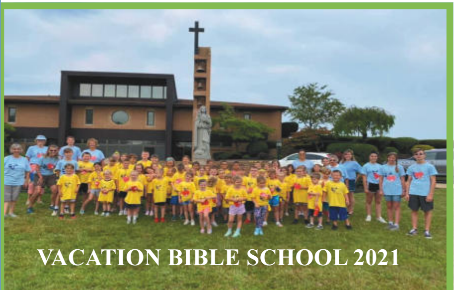
VACATION BIBLE SCHOOL 2021