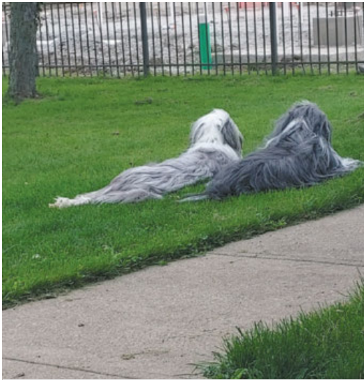
Waiting patiently for the new building...