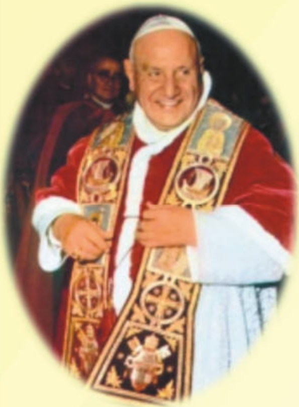
FEAST DAY—OCTOBER ELEVENTH

“The Ecumenical Council will surely be, even more than a new and magnificent Pentecost, a real and new Epiphany, one of the many revelations which have been renewed and are continually being renewed in the course of history, but one of the greatest of all.”