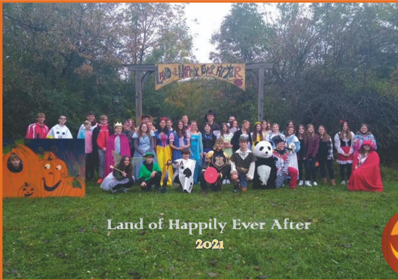
Land of Happily Ever After 2021

Between the two statues of the Popes, John XXIII and John Paul II is a picture of Blessed Carlo. On Saturday, Oct. 10, 2020, in Assisi, Carlo Acutis was beatified. On Oct. 12, the Church celebrated his feast for the first time, on the 14th anniversary of Blessed Carlo's 2006 death of acute leukemia. BLESSED CARLO , pray for our young people that they grow in the love of Jesus.