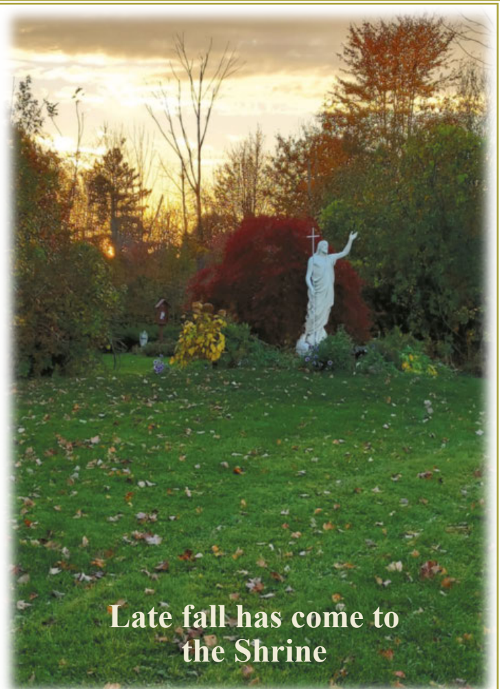
Late fall has come to the Shrine