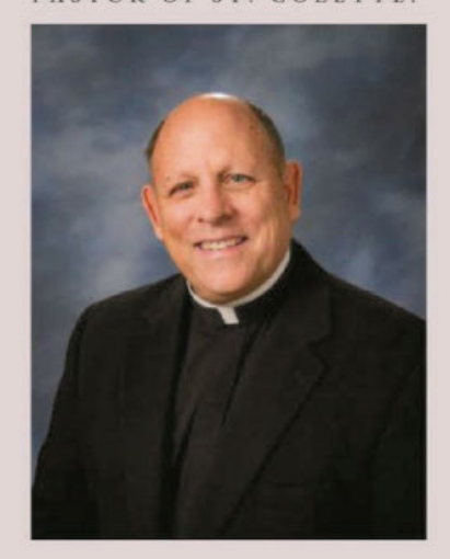
We can't wait to welcome you!